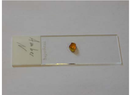
Fig. 1: Amber mounted on microscope slide with Epotec 301

Desired sections were prepared at thicknesses between 20 and 50 \mu\text{m} . Sections were clear and translucent (fig. 3). Thickness of a sample can be calculated by OCT imaging independent of mounting layer thickness. Translucency of amber gives few signals in the OCT image, just the adhesive surface of amber can be displayed in OCT image. This translucency is very important to image inclusions in samples of amber.